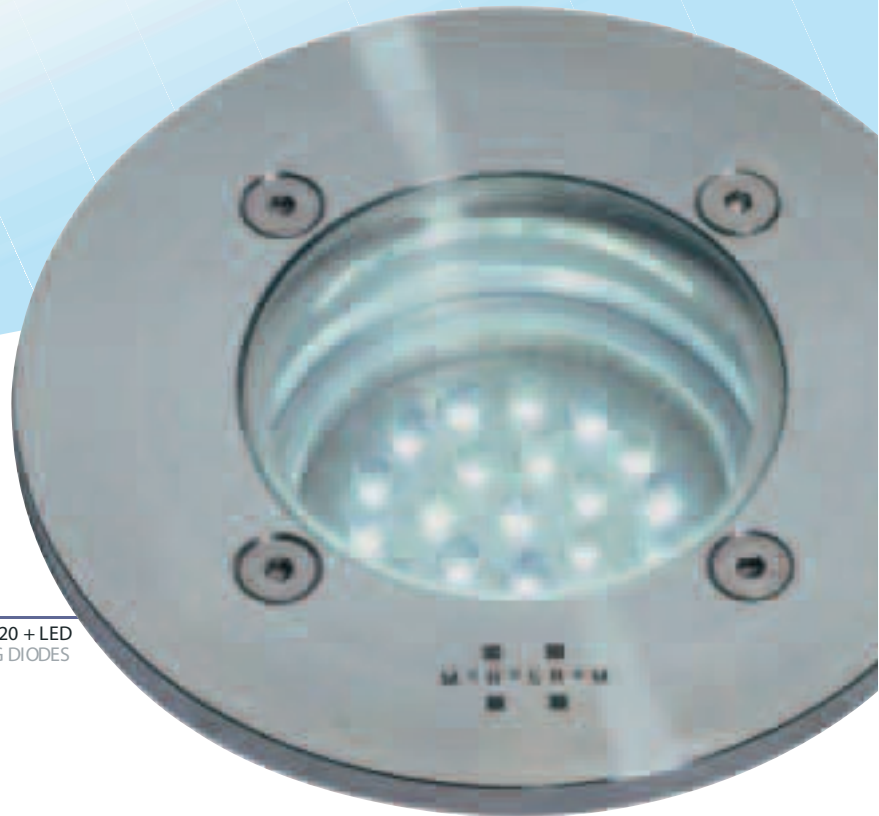
LE 120 + LED LIGHT EMITTING DIODES