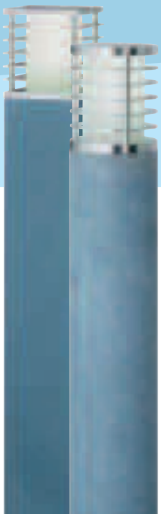
QE 101 BLH BLUE HARD STONE